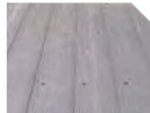
POLY BOARD FLOOR