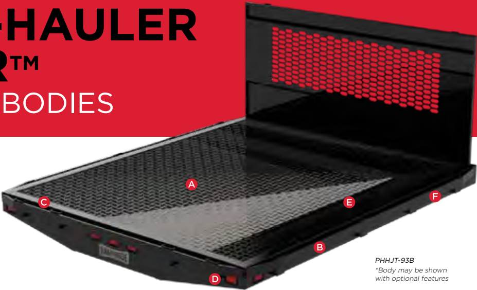
PHHJT-93B *Body may be shown with optional features

The Heavy-Hauler Junior™ (PHHJ) is a durable, standard duty platform with distinctive tail skirt styling and rub rails. It has been engineered to work in both hoist and non -hoist applications.