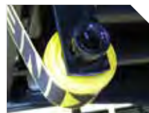
UNDERBODY SLIDING TIE-DOWN CHANNEL