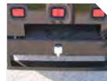
UNDERBODY STORAGE COMPARTMENT Available in 8' and 10' lengths