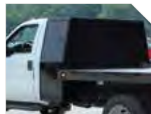
KNAP-PACK Also available in straight and tapered sides