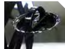
INTEGRATED D-RING TIE DOWNS