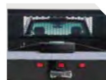
SPARE TIRE RETAINER