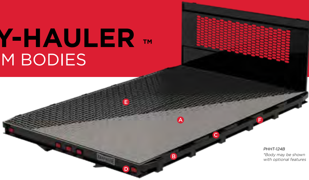
PHHT-124B *Body may be shown with optional features

The Heavy-Hauler™ (PHH) is Knapheide's most rugged platform, designed to handle the most severe of hauling applications. It has been engineered to work in both hoist and non-hoist applications.