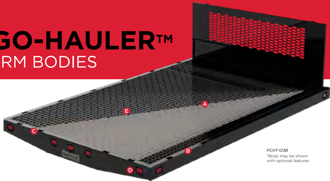
PCHT-123B *Body may be shown with optional features

Knapheide's Cargo-Hauler™ (PCH) platform has a robust understructure to withstand tough job site applications. The PCH is a heavy duty platform with distinctive tail skirt styling. It has been engineered to work in both hoist and non-hoist applications.