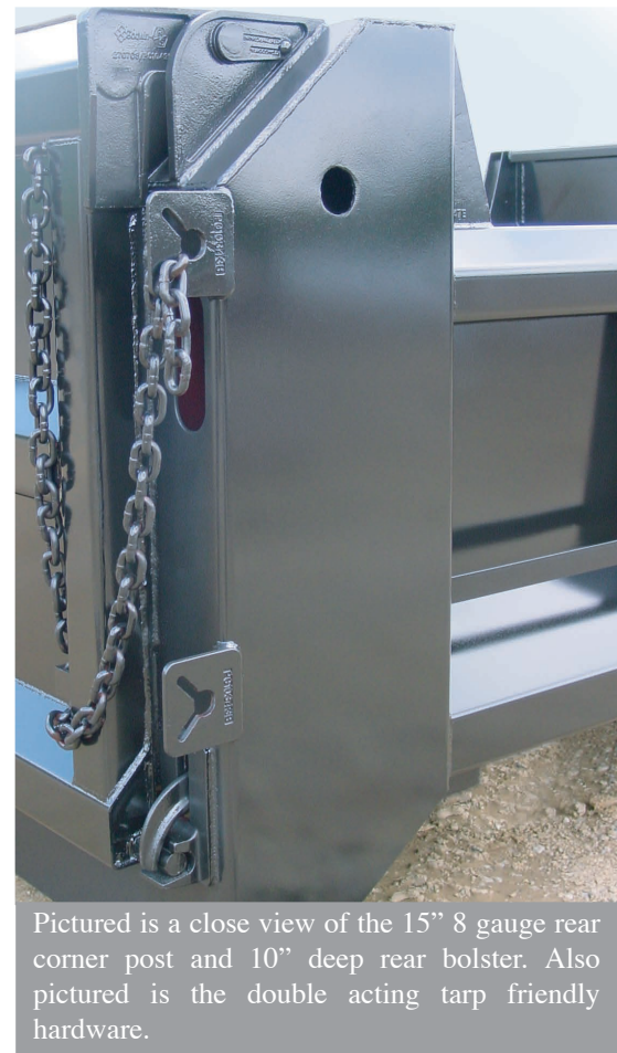
Pictured is a close view of the 15" 8 gauge rear corner post and 10" deep rear bolster. Also pictured is the double acting tarp friendly hardware.

FULL FACTORY WARRANTY complete parts and service available through nationwide authorized distributors