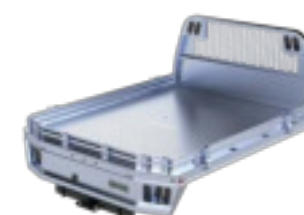
ALUMINUM DROP SIDES