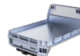
ALUMINUM 6" HIGH SIDES