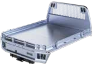
ALUMINUM DROP SIDES