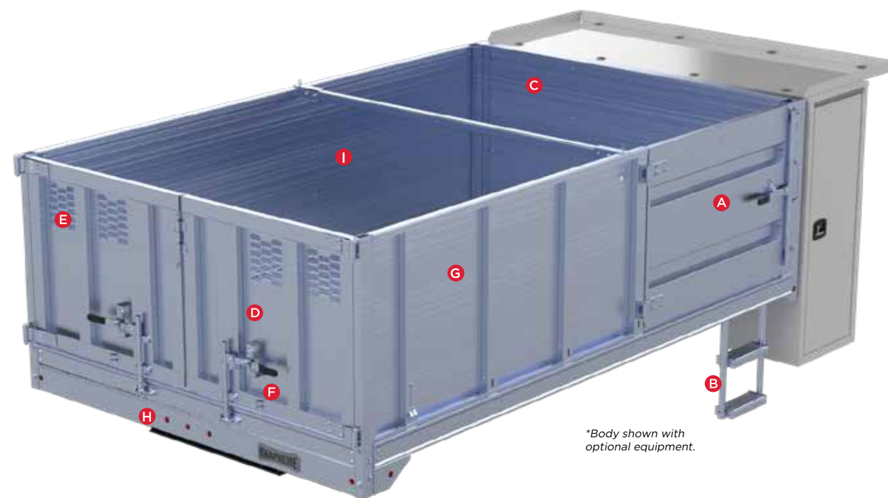
*Body shown with optional equipment.

resulting in a body that is 40% lighter than steel, returning payload back to the operator