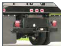
COMBINATION CLASS V HITCH AND ICC BUMPER