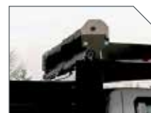
PULL TARP SYSTEM