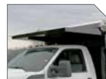
42" CAB PROTECTOR WITH 4 TIE DOWNS