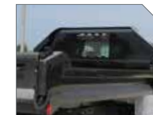
TAPERED QUARTER CAB PROTECTOR