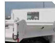
STRAIGHT QUARTER CAB PROTECTOR

-P' denotes prime paint; '-B' denotes black finish paint. GM C/K 3500 chassis applications