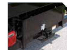
CLASS V RECEIVER HITCH