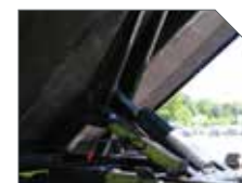
BODY RAISE INDICATOR