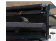
STRAIGHT FULL CAB PROTECTOR