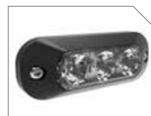
FRONT STROBE LIGHTS