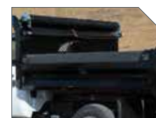
POLY BOARD EXTENSIONS