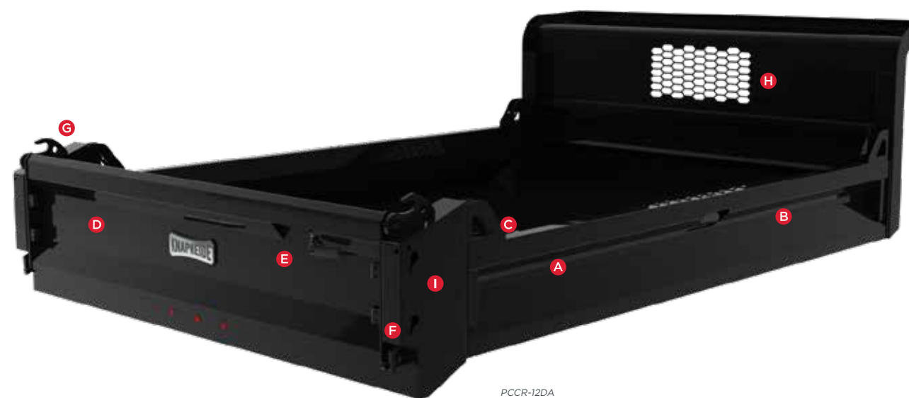
PCCR-12DA *Body may be shown with optional features

constructed of 10-gauge high tensile steel with a punched window for visibility