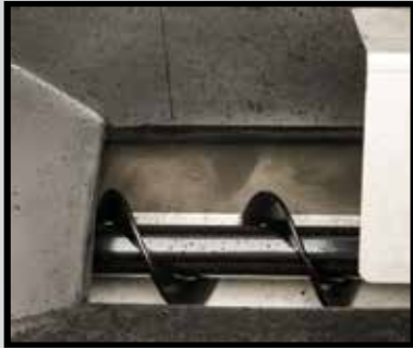
5-1/4" full length carbon steel auger with 3/4 HP motor