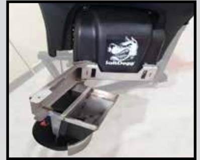
High flow swing-away chute and large 14" spinner with 1/2 HP motor