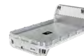
ALUMINUM 6" HIGH SIDES