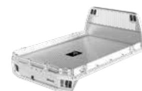
ALUMINUM DROP SIDES