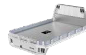
ALUMINUM 6" HIGH SIDES