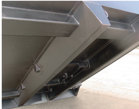
Pictured is a close view of the 450U's cross-memberless understructure and heat ducts.

FULL FACTORY WARRANTY complete parts and service available Through nationwide authorized distributors