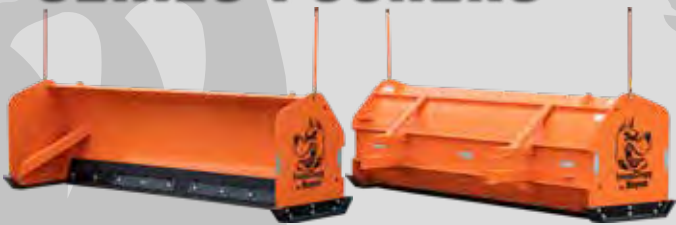
Backhoe (pg. 8-9)