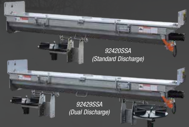
92420SSA (Standard Discharge)