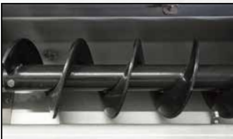
Heavy Duty 9 inch Dia. Auger for 92450SSA and 92452SSA 6 inch Dia. Auger for all other models