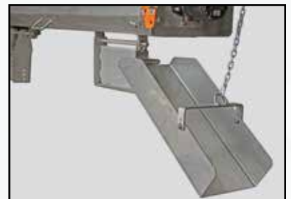
92451SS Optional Berm Chute For heavy duty 9 inch auger model (92450SSA / 92452SSA)