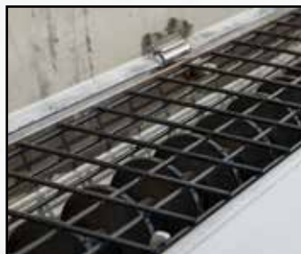
UTS Auger Screen Included