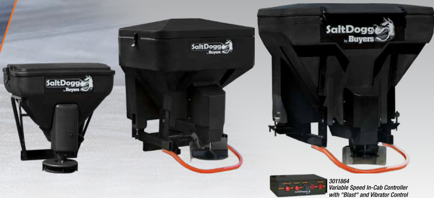
3011864 Variable Speed In-Cab Controller with "Blast" and Vibrator Control

Feed Mechanism: Horizontal auger feed (stainless steel trough for TGS03 and TGS07) Motor: 12V dual shaft gear motor (1/2 HP for TGS07, TGS03 and 1/3 HP for TGS02) Spread Range: 3-30 feet Power: Electric Construction: Poly hopper, powder-coated steel frame Mount: 2 inch receiver hitches