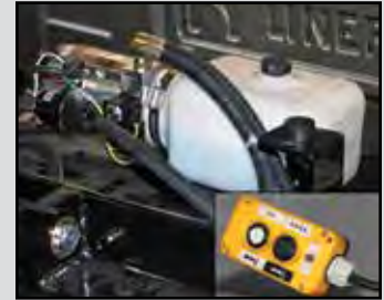
Power up & power down power unit with 10' tethered control box