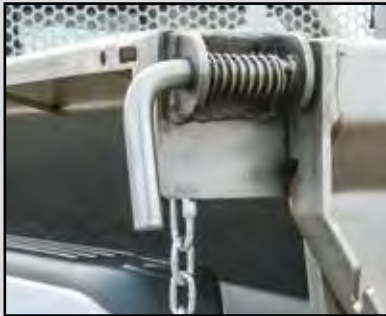
3/4" Diameter stainless steel tailgate hitch pins