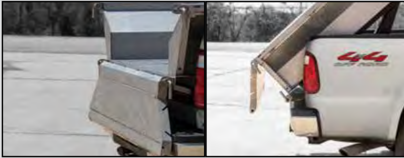
Double pivoting & removable tailgate