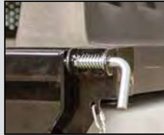
3/4" Diameter tailgate hitch pins