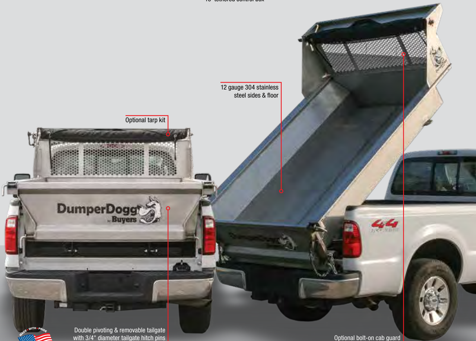
Optional tarp kit