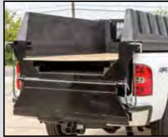
Design accommodates full sheets of plywood