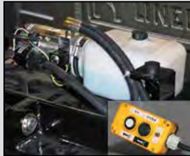
Power up & power down power unit with 10' tethered control box