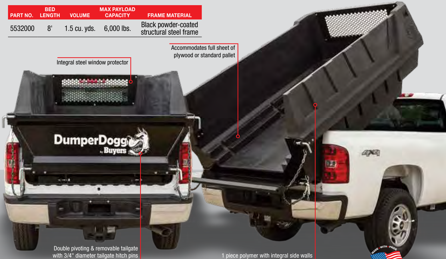
Integral steel window protector