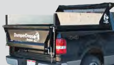
5531020 shown with 2' x 12" boards