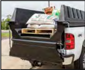
Design accommodates standard pallet