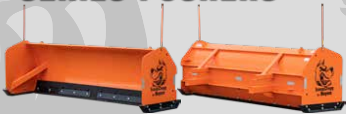
Backhoe (pg. 8-9)