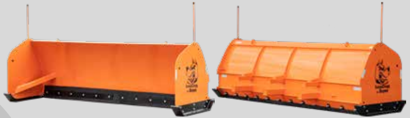
Loader (pg. 6-7)