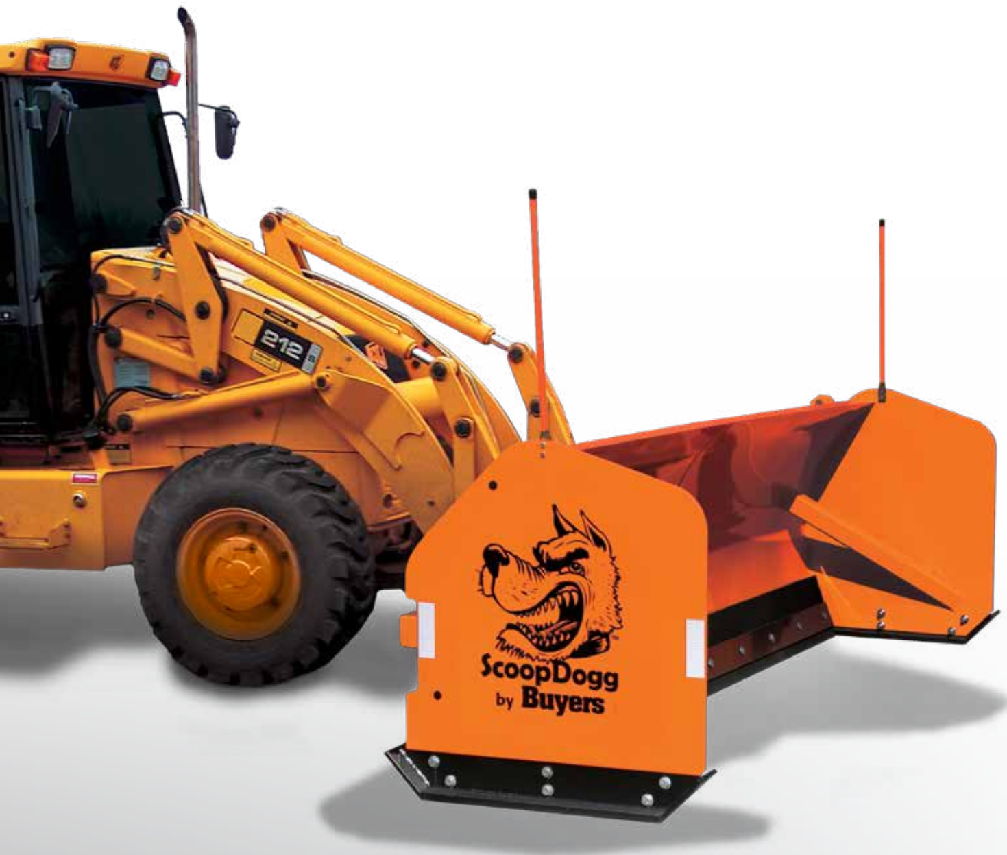
7 Ga Rolled Steel Moldboard with 3/8" thick side plates