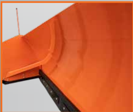
Rubber Edge 3/8" x 4" rubber edge mounting bracket, 1-1/2" x 10" premium rubber edge, 5/8-11, grade 5 carriage bolts