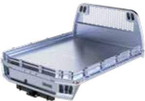
ALUMINUM 6" HIGH SIDES